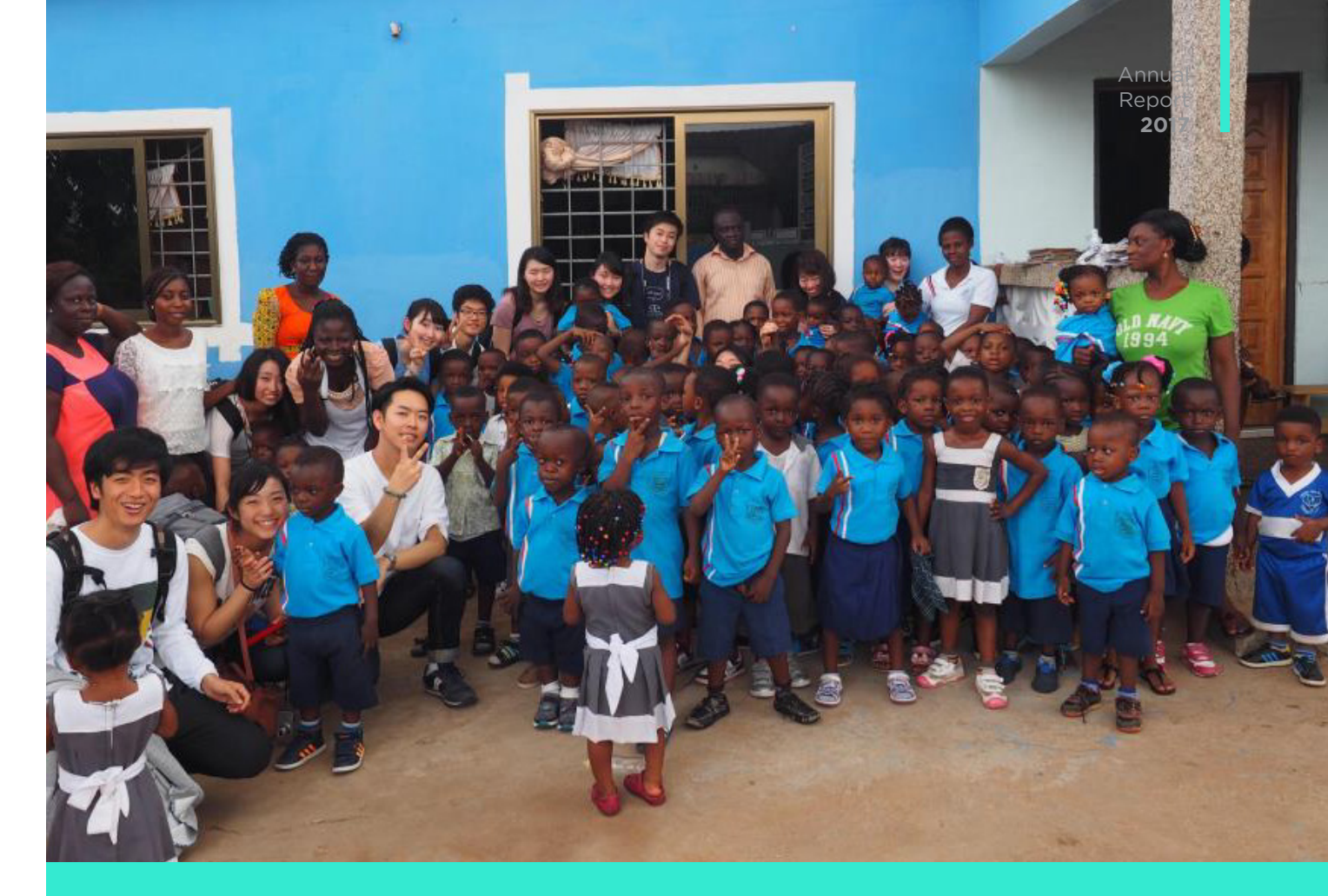
A big thank you to all of our donors that contributed to our project